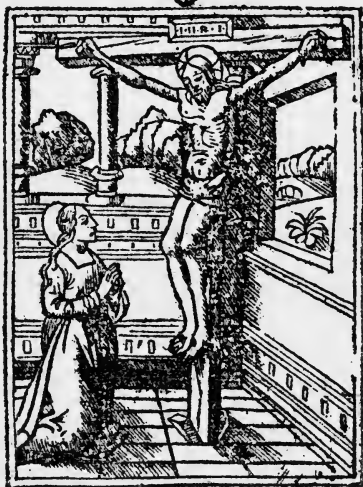
Title page of original Italian edition, published (? 1536)